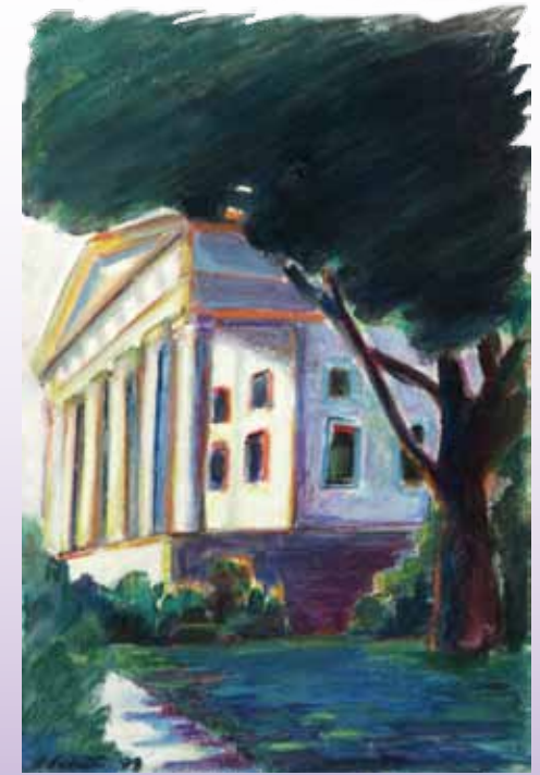
Sketch, Carnegie Art Museum , oil pastel on paper by Suzanne Schechter. 1993. Carnegie Art Museum Collection. Gift of the Artist.