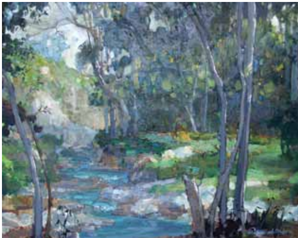
Lost Creek, Batiquitos Lagoon , oil on board by Peter Adams, 1990s. Carnegie Art Museum Collection.