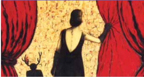
Enter Tormenta , acrylic on canvas by Gronk, 2001. Carnegie Art Museum Collection.

Museum Members each year enjoy an outstanding season of exhibitions and events, including: