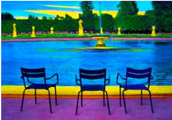
Paris Chairs , cibachrome, hand painted, photoshop enhanced, archival fuji flex chrome print by Jane Gottlieb, 2007. CAM Collection. Gift of the Artist.