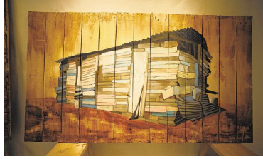
Just one of many art pieces by Olguin Tapia awaiting installation at the CAM Studio Gallery located in Oxnard Friday afternoon.

Tapia said he's been working since June 27 from early in the morning until late at night to complete the five paintings, four drawings and 13 sculptures for the exhibit. "I wanted to use this studio space to